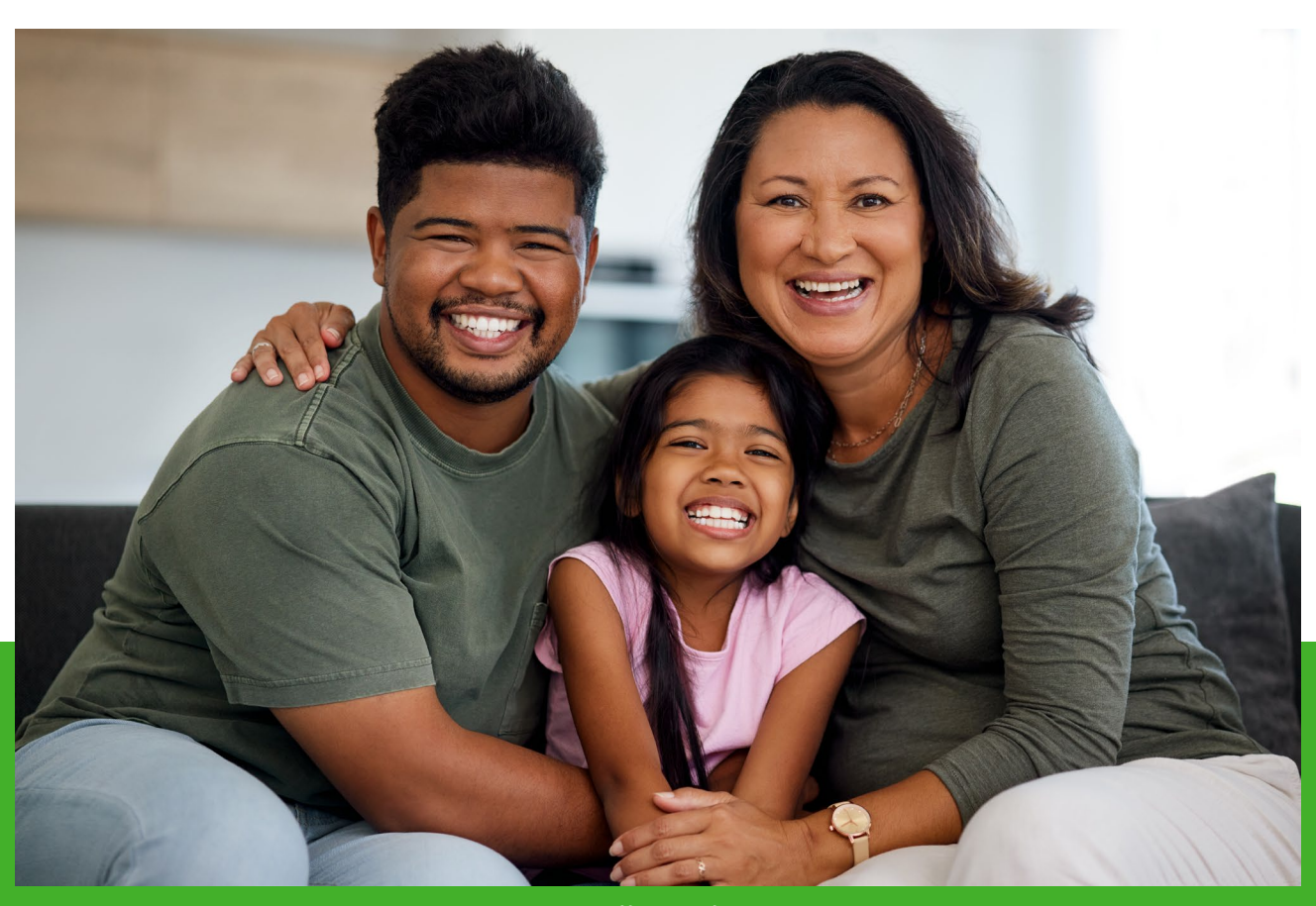
Live Well, Smile More